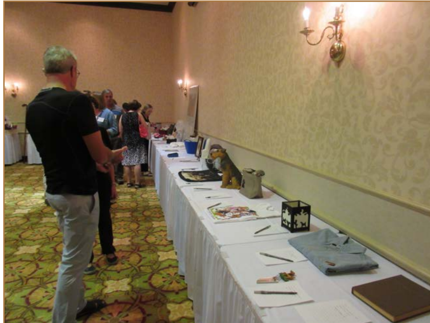
On Saturday night at the Nationals, the silent Auction tests our competitive bidding.

Though it may sound like a relatively straight-forward test, dogs who don't regularly hunt ducks or train with retriever clubs often find it more difficult than anticipated. Of the starting group of Airedales, five would pass the Retriever land series and advance to Sunday's water retriever series.